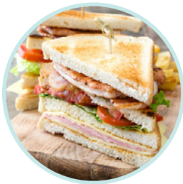
Sandwiches, burgers, and tacos

There's often a lot of sodium in popular foods like: