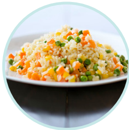
Rice, pasta, and other grain dishes