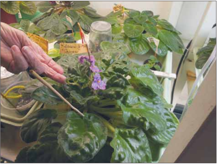
Georgie points to the different parts of a Chimara African violet. A chimera in mythology is a beast containing the parts of two or more different animals. In African violets, a chimara will have different color sections due to two different gene components growing side by side.

Georgie Stebbins has discovered that hard work caring for the people and flowers she loves is the best way to live.