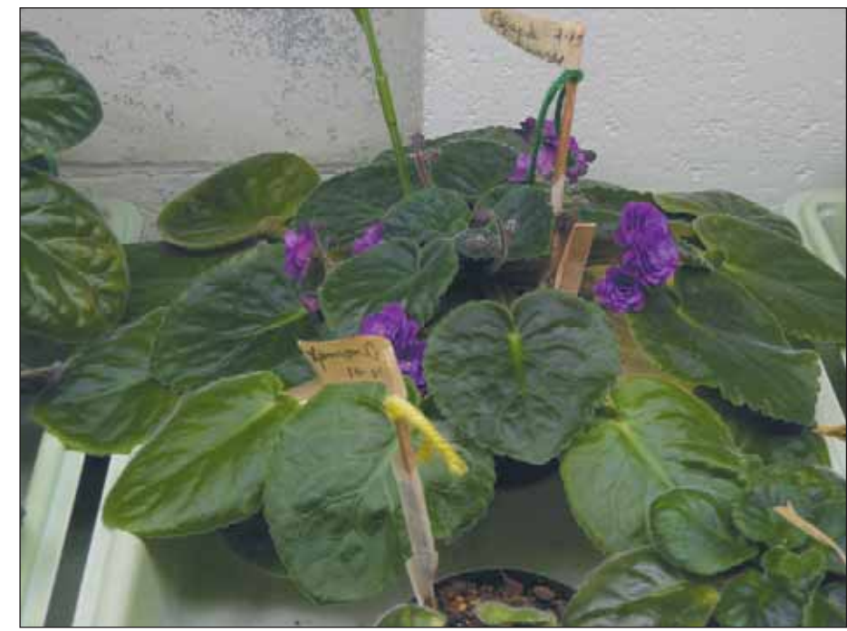
Blue Boy is the first named African violet. African violets may live for 50 or more years, some say indefinitely.