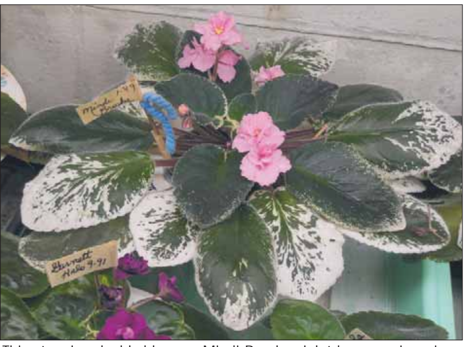
This stunning double-blossom Mindi Brooke violet has mosaic variegation which produces little streaks and splashes of color.