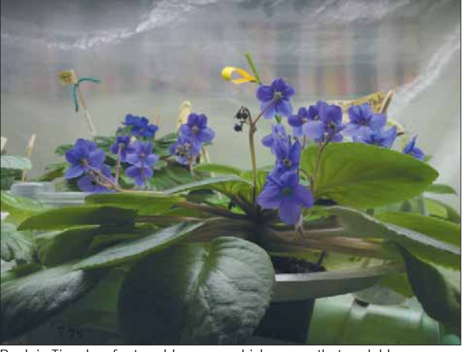
Back in Time has fantasy blossoms, which means that each blossom contains more than one color (i.e., a mixture of dark and light of the same color or even different colors).