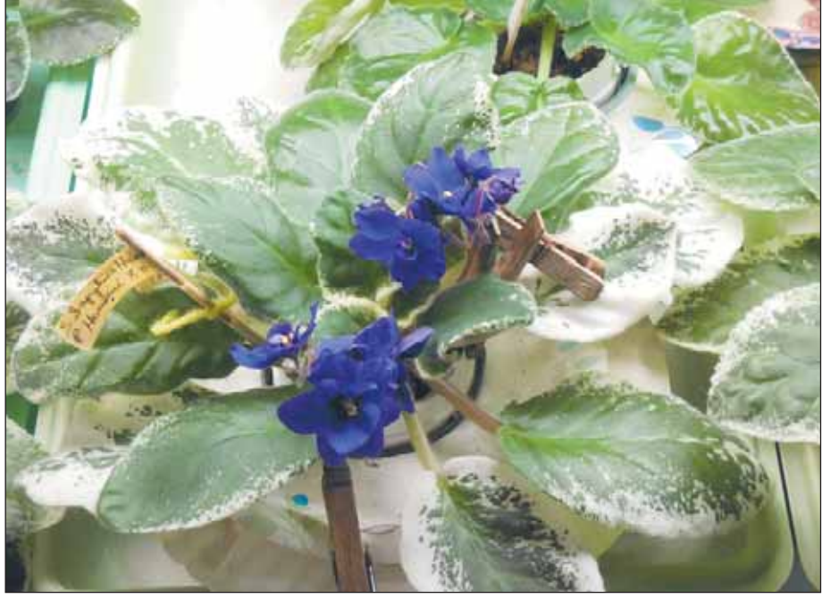
The Sapphire Halo violet boasts the distinctively beautiful Tommie Lou foliage. Clothespins are used to lower the leaves.