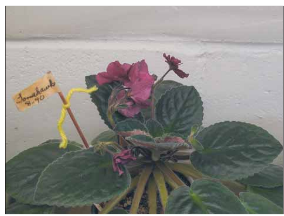
This deep red African violet dubbed Tomahawk is one of Georgie's mother plants and is designated as such by the yarn tied around the marker.